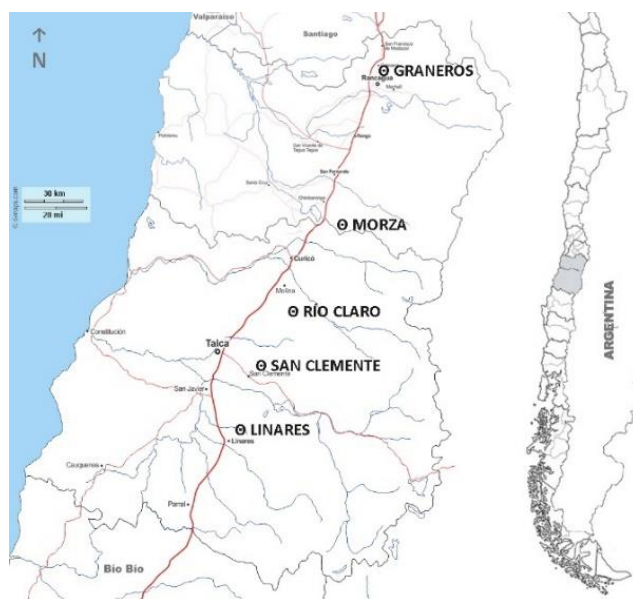
Figure 1. Geographical location of the apple orchards studied.

Sixteen tuples were obtained, which considered FB dates, harvest start and meteorological records of the fruit growing season (Table 1).